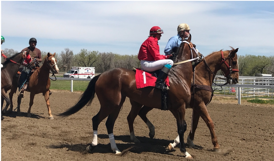
Horses coming onto the track for race 1 in Miles City - 2019

Nine days have been allocated for the 2021 season. Everyone is anxious for the season as people are ready to get outside and enjoy horse racing once more. Miles City will also simulcast in the Kentucky Derby and will be racing on Derby day for the first time ever. Great Falls has been working on their facility and with their new grandstand, lots of improvements await their loyal fans. Miles City Buck Horse Sale Race Meet is schedule to run May 1, 9, 15 & 16. State Fair Race Meet in Great Falls will race on July 24, 25, 30, 31 & August 1 st . Funds to be distributed to the race meets in 2021 must be split between purses and operations. Those distribution amounts are: Miles City - $65,000 and Great Falls - $110,000.