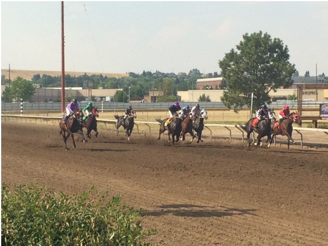
Horses racing to the finish in Great Falls – 2017.