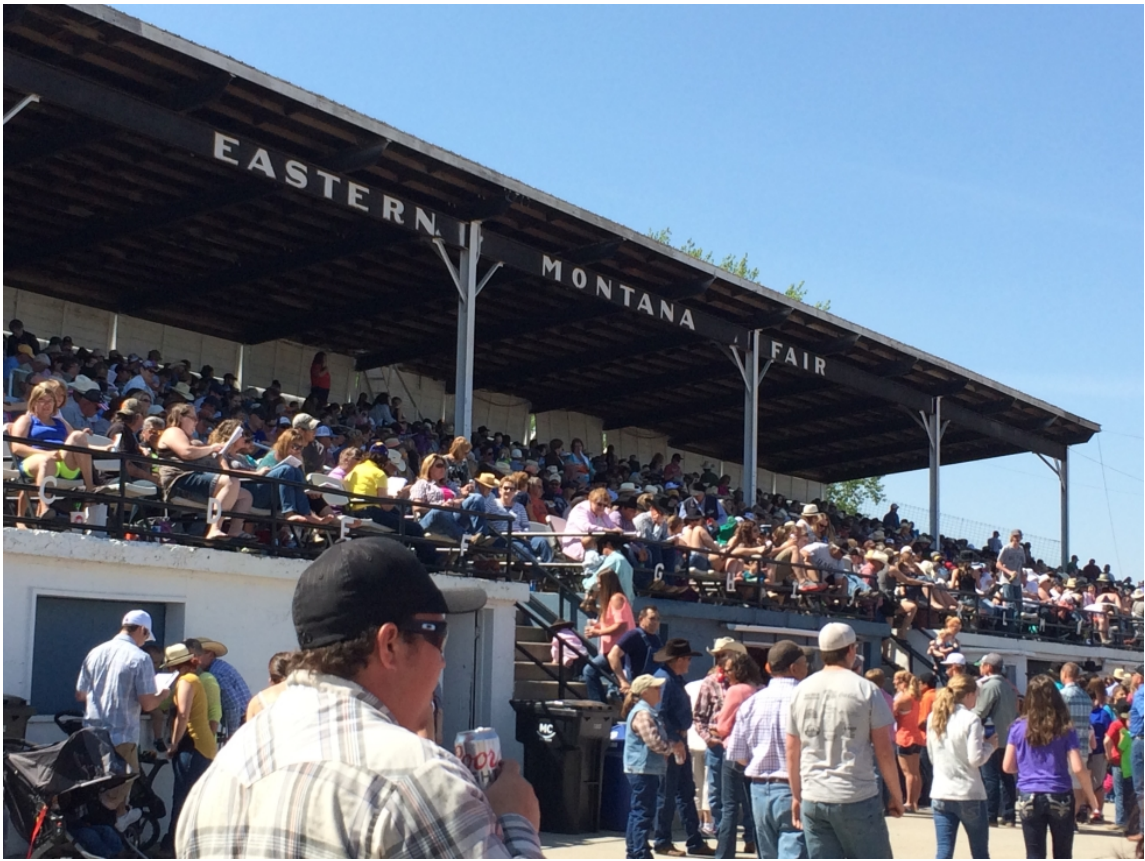
Picture taken at the Miles City in 2016.